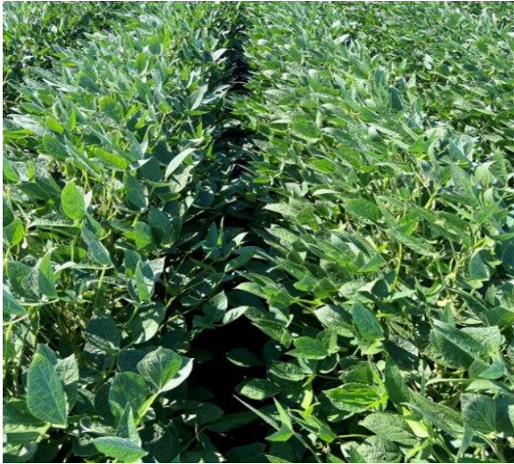
P40A36E™ Mid-Season Growth Habit