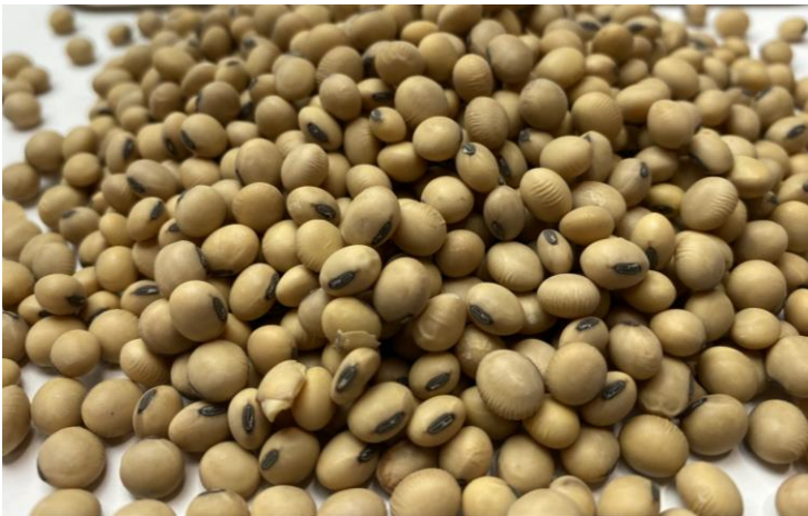
P40A36E™ Harvested Grain