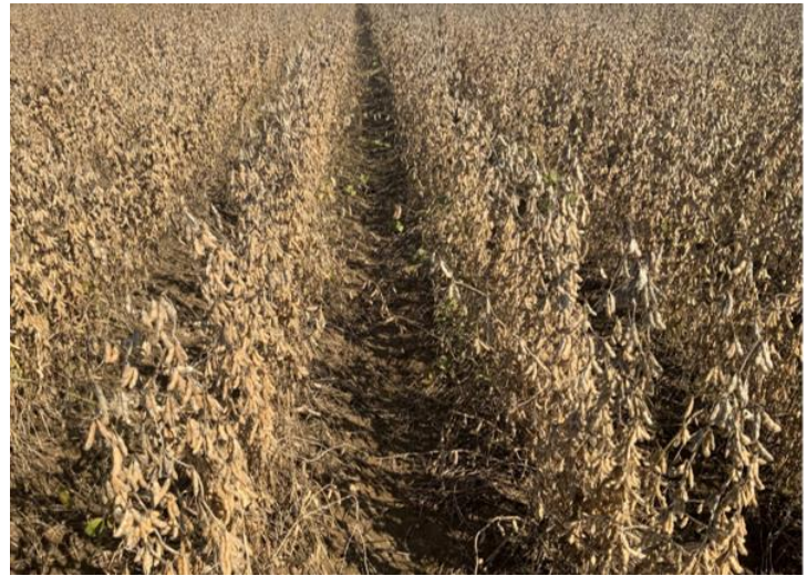
P40A36E™ at Harvest