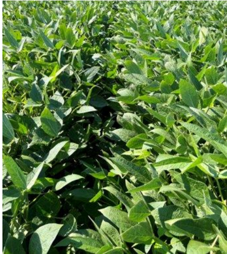
P44A91E™ Midseason Growth Habit