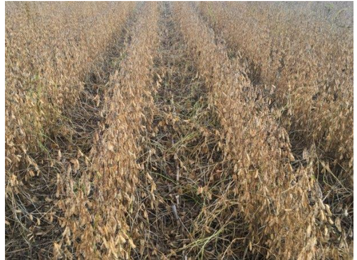
P44A91E™ at Harvest