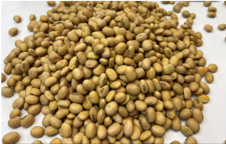
P44A91E™ Harvested Grain