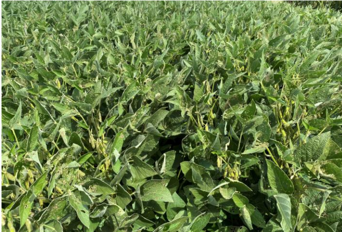
P38A54E™ Mid-Season Growth Habit