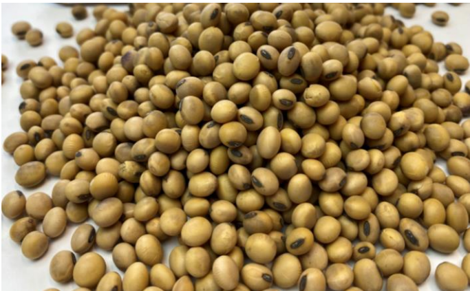
P38A54E™ Harvested Grain