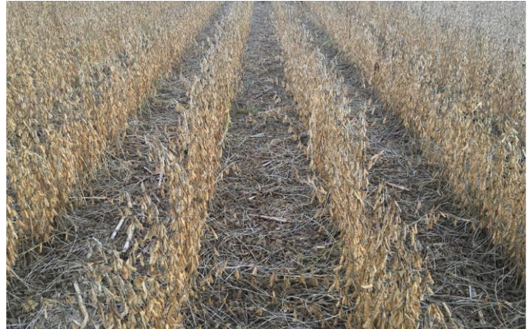
P38A54E™ at Harvest