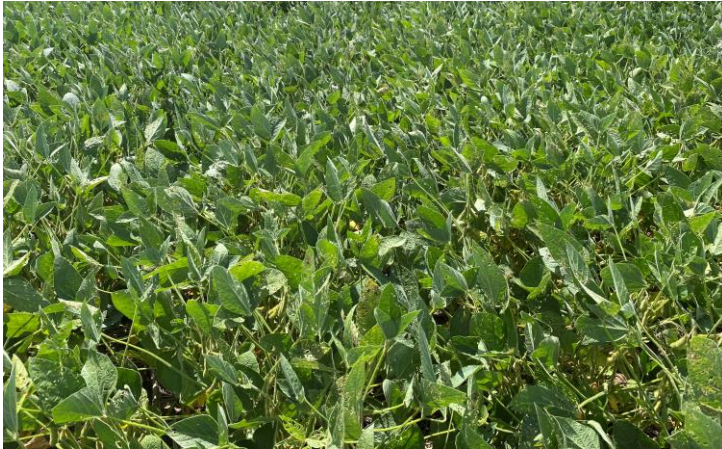
P17A87E™ Mid-Season Growth Habit