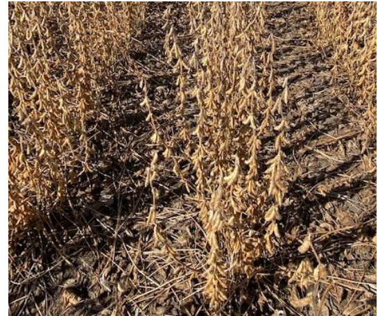
P17A87E™ at Harvest