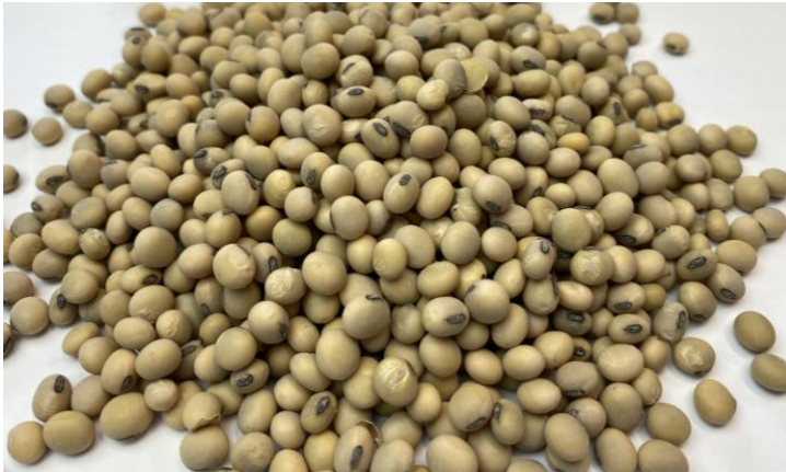
P17A87E™ Harvested Grain