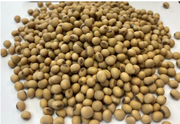
P25A16E™ Harvested Grain