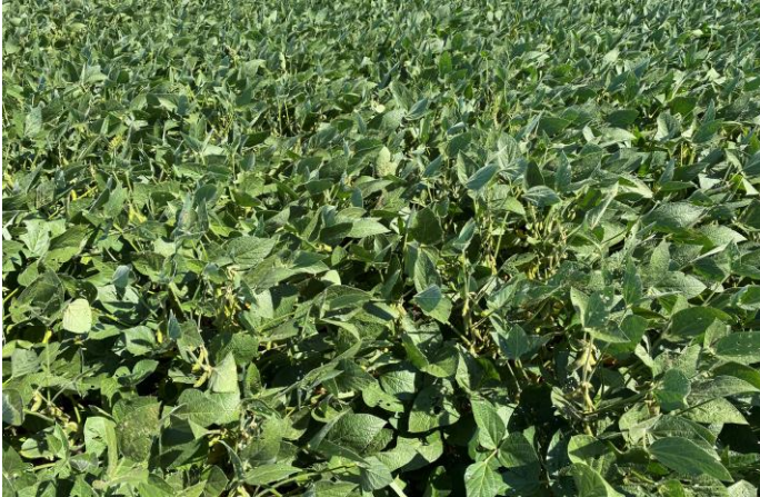
P25A16E™ Mid-Season Growth Habit