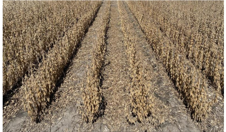
P25A16E™ at Harvest