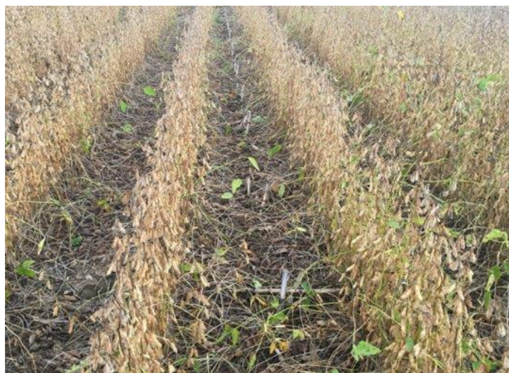
P46A09E™ at Harvest