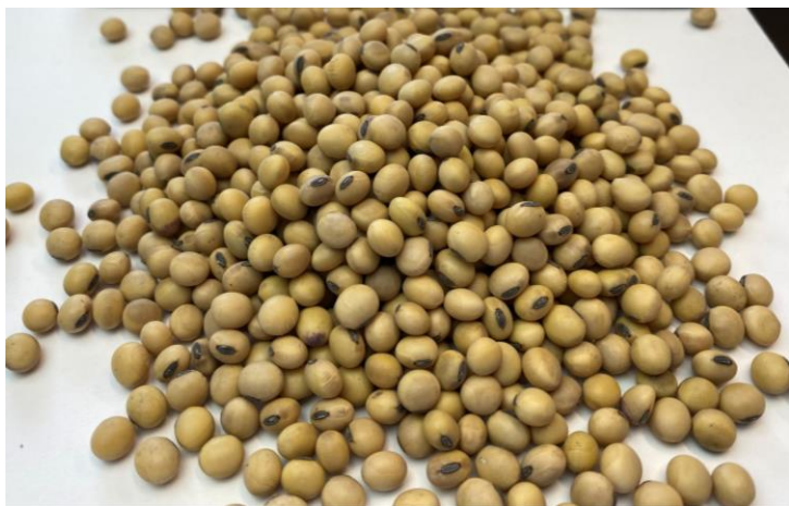
P46A09E™ Harvested Grain