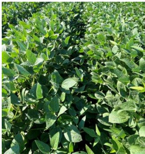
P46A09E™ Midseason Growth Habit