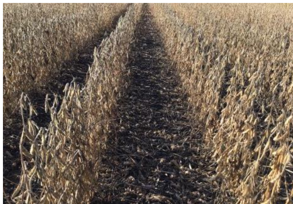
P06A85E™ at Harvest