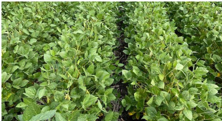
P06A85E™ Mid-Season Growth Habit