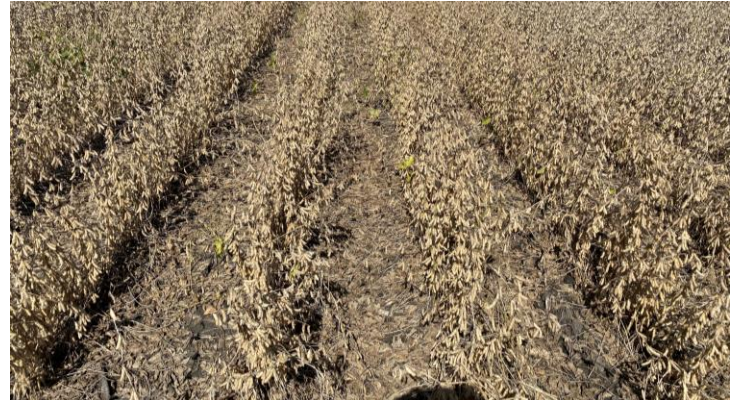
P28A65E™ at Harvest