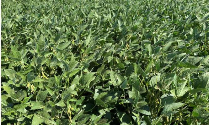
P28A65E™ Mid-Season Growth Habit