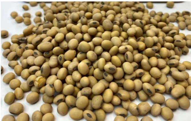
P28A65E™ Harvested Grain