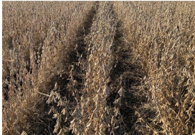
P45A79E™ at Harvest