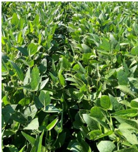
P45A79E™ Midseason Growth Habit