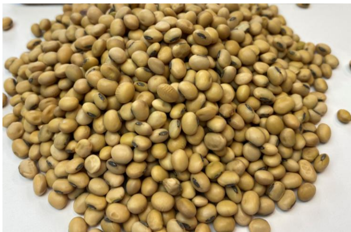
P45A79E™ Harvested Grain