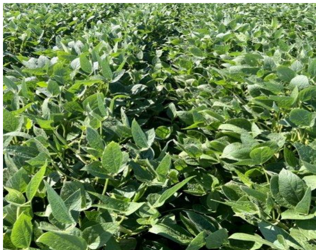
P40A23E™ Mid-Season Growth Habit