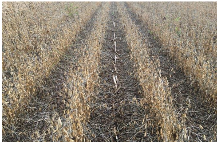
P40A23E™ at Harvest