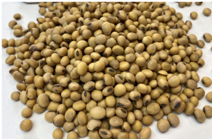
P37A18E™ Harvested Grain