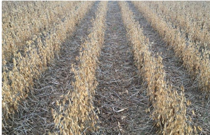
P37A18E™ at Harvest