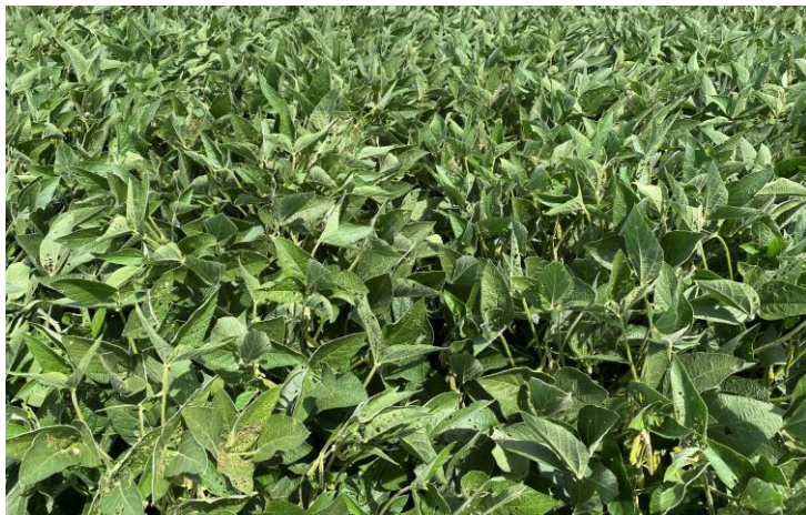
P37A18E™ Mid-Season Growth Habit