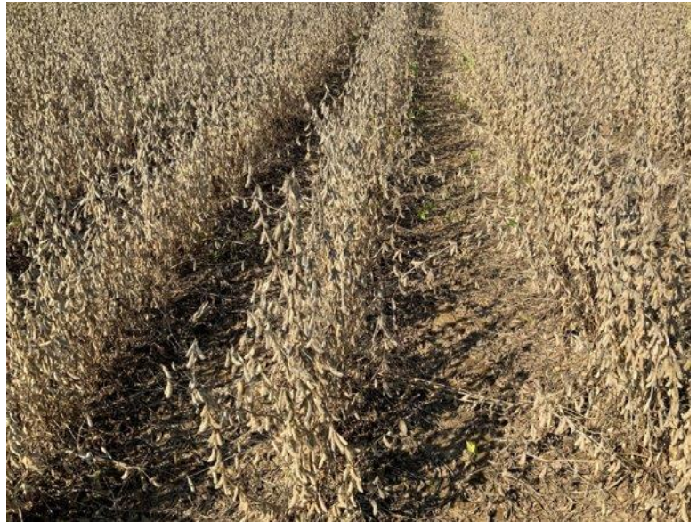
P46A67E™ at Harvest