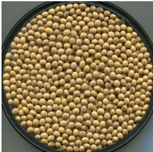
P46A67E™ Harvested Grain