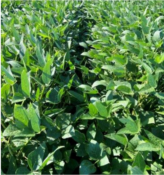
P46A67E™ Midseason Growth Habit