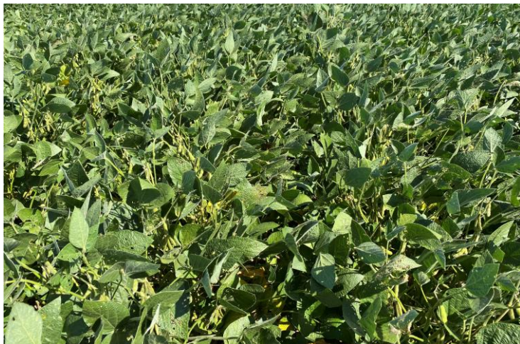
P23A40E™ Mid-Season Growth Habit