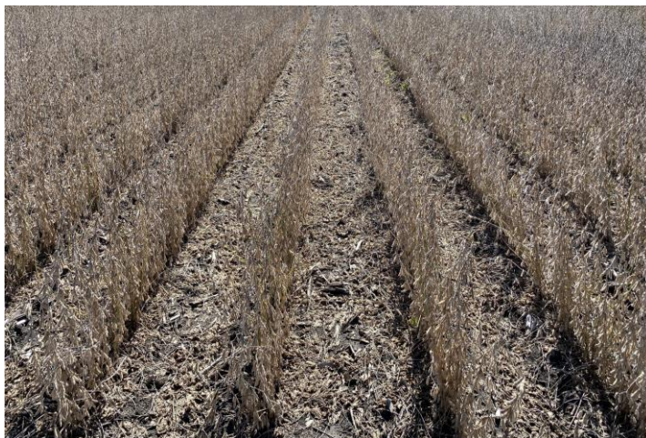
P23A40E™ at Harvest