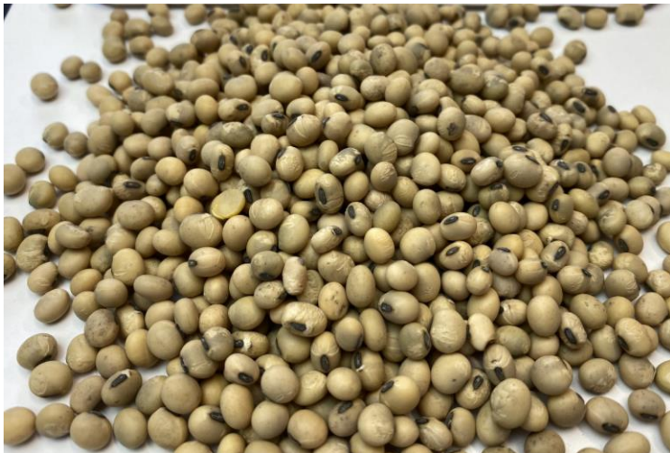
P23A40E™ Harvested Grain