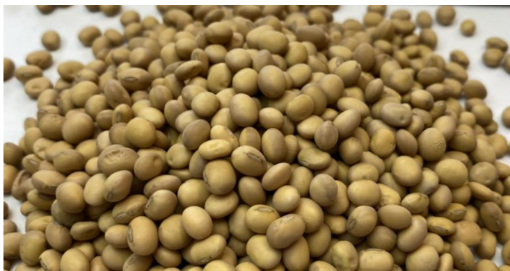
P42A84E™ Harvested Grain