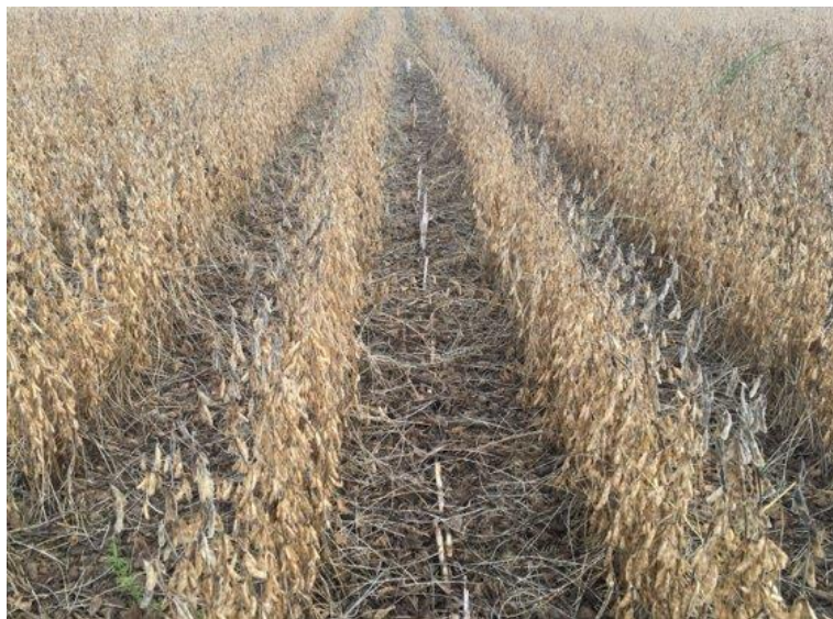
P42A84E™ at Harvest