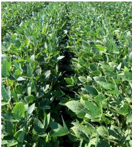
P42A84E™ Midseason Growth Habit