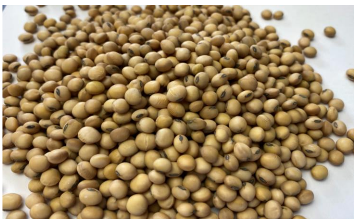
P56A71E™ Harvested Grain