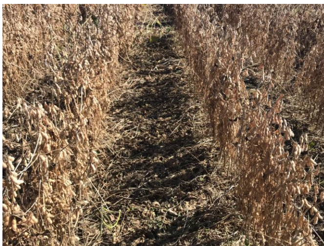
P56A71E™ at Harvest