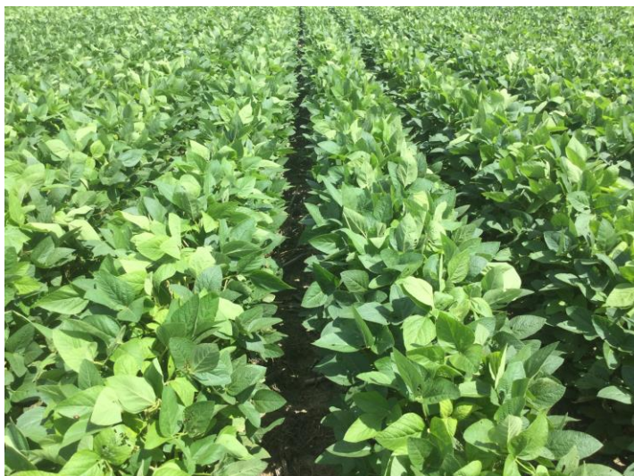
P56A71E™ Midseason Growth Habit