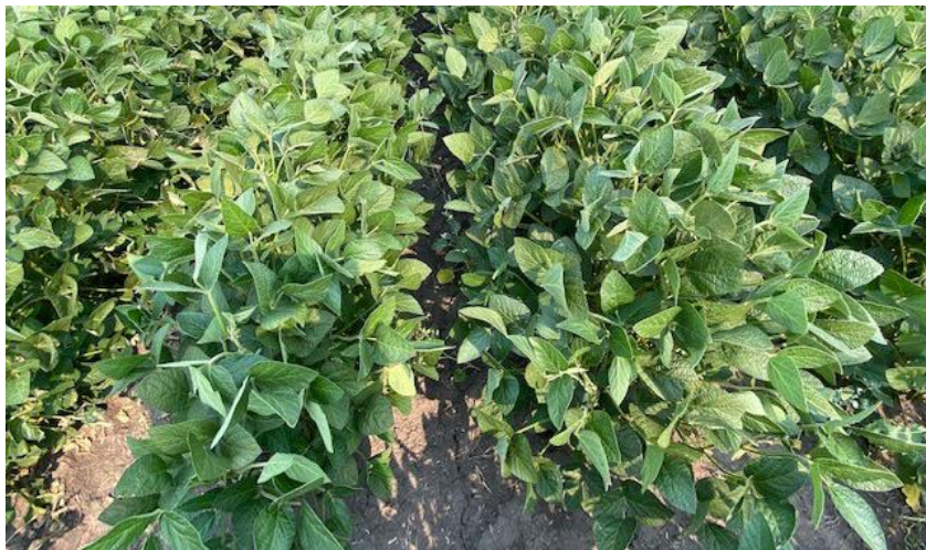
P04A98E™ Mid-Season Growth Habit