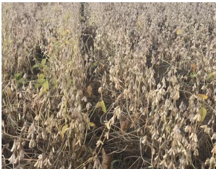
P63A93E™ at Harvest