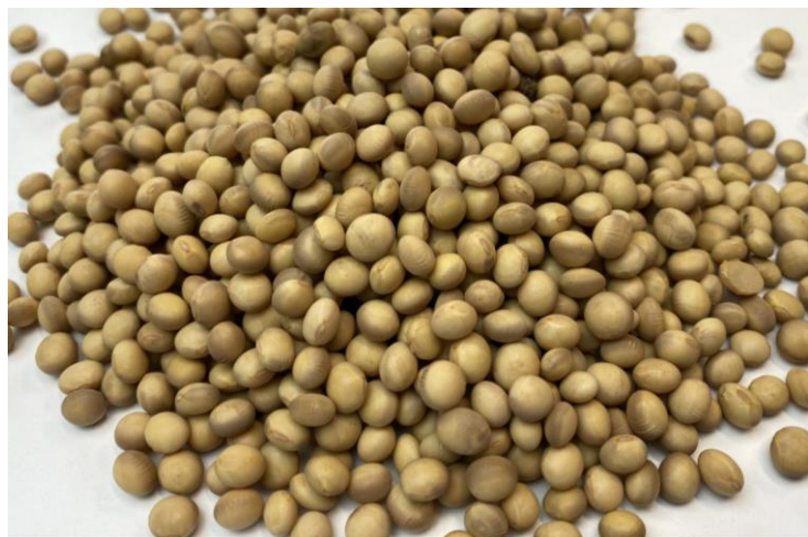
P63A93E™ Harvested Grain