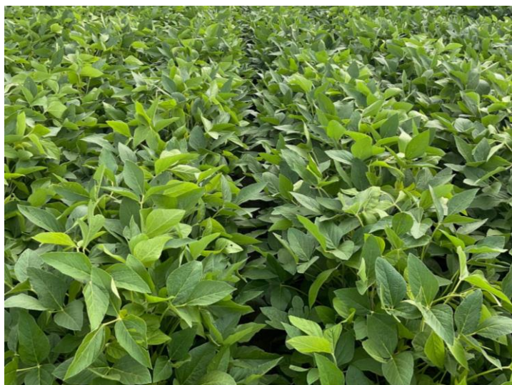
P63A93E™ Midseason Growth Habit