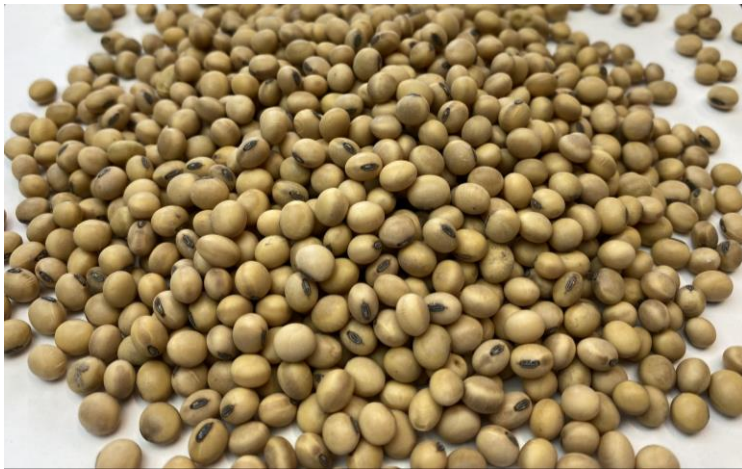
P48A18E™ Harvested Grain