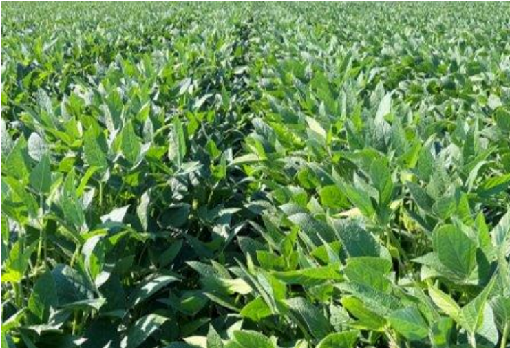
P48A14E™ Midseason Growth Habit