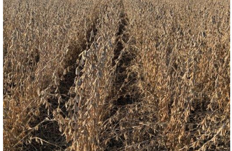
P48A14E™ at Harvest