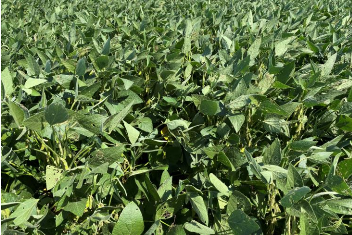
P29A19E™ Mid-Season Growth Habit