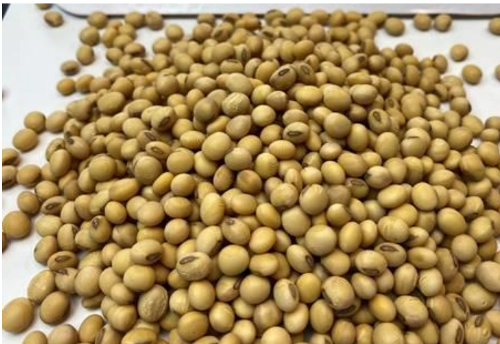
P29A19E™ Harvested Grain