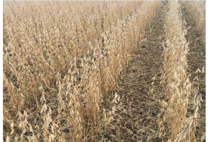
P29A19E™ at Harvest