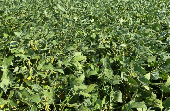
P21A53E™ Mid-Season Growth Habit