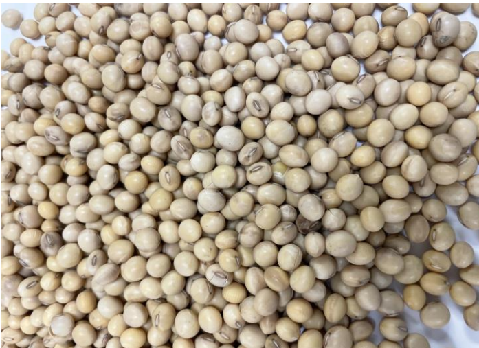
P21A53E™ Harvested Grain