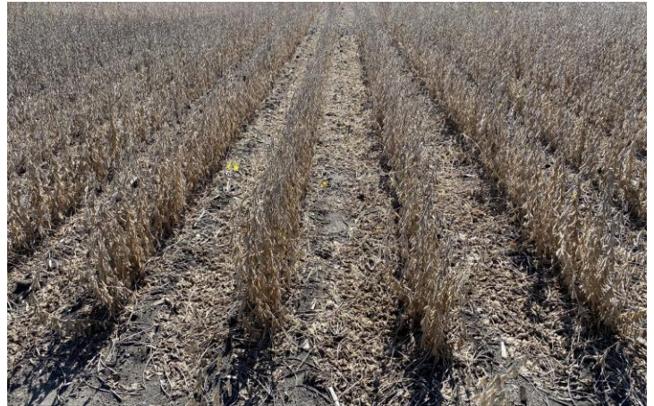
P21A53E™ at Harvest