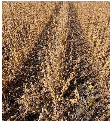
P19A66E™ at Harvest