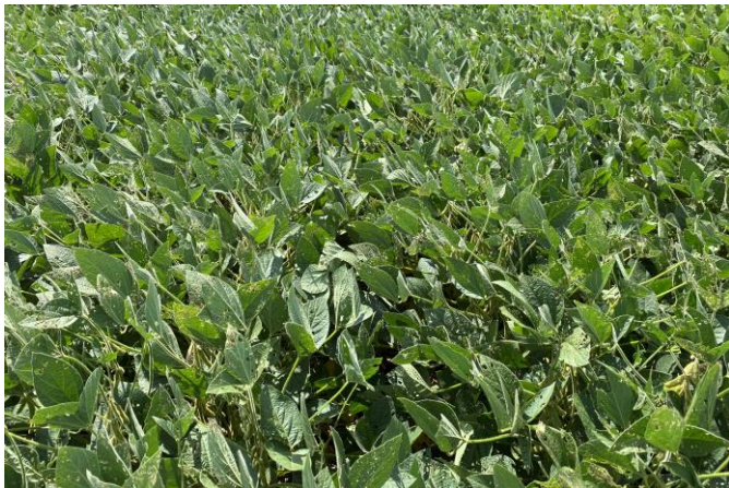
P19A66E™ Mid-Season Growth Habit