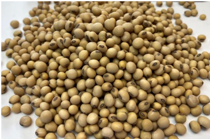
P19A66E™ Harvested Grain